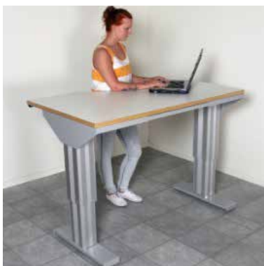
7190 Electric Table Frame