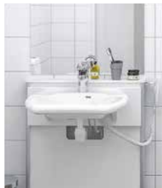
415 Electric Washbasin Lift