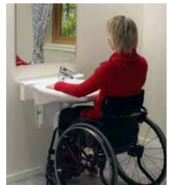
406 Washbasin Bracket Lift