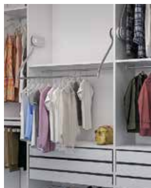
722 Electric Wardrobe Lift