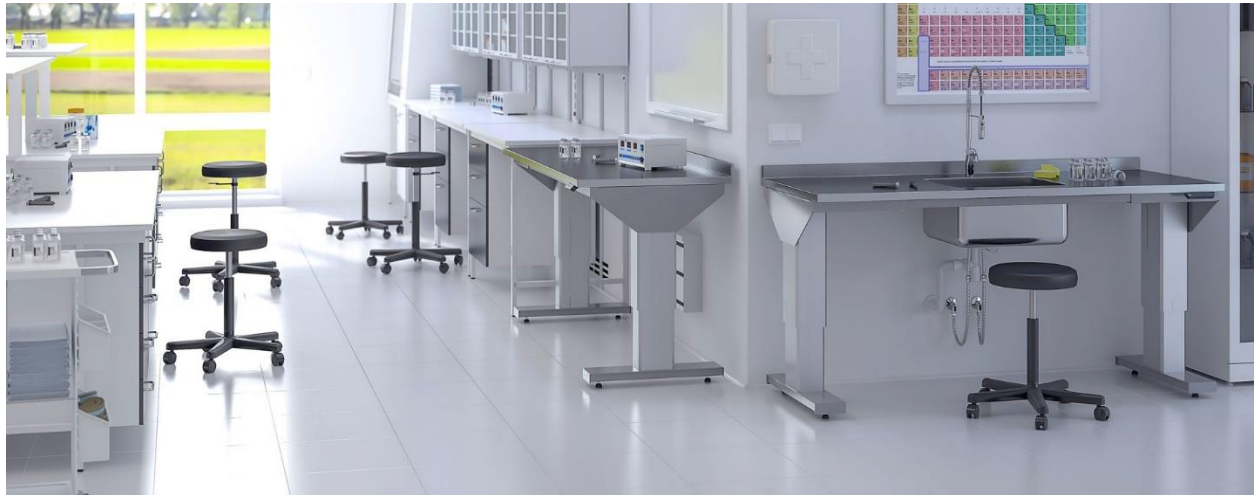
Table Frame - Electric (7190)