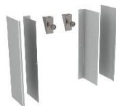
Cover panel fittings