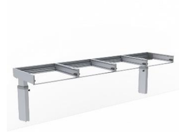
Manulift 6380H for widths 189cm to 240cm