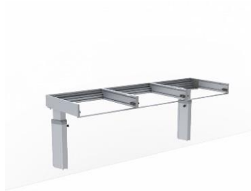
Manulift 6380H for widths 109cm to 180cm