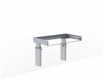
Manulift 6380H for widths 59cm to 100cm