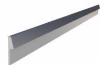
Rear Edge Trim